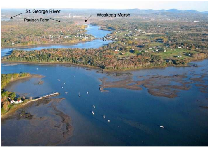
☆ Tidal restriction on the Weskeag, accounting for an extended low tide between the two rivers